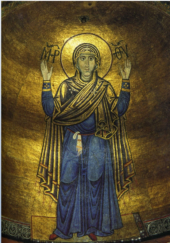
Virgin Orans icon of Kyiv

La Chiesa in numeri | La Iglesia en cifras