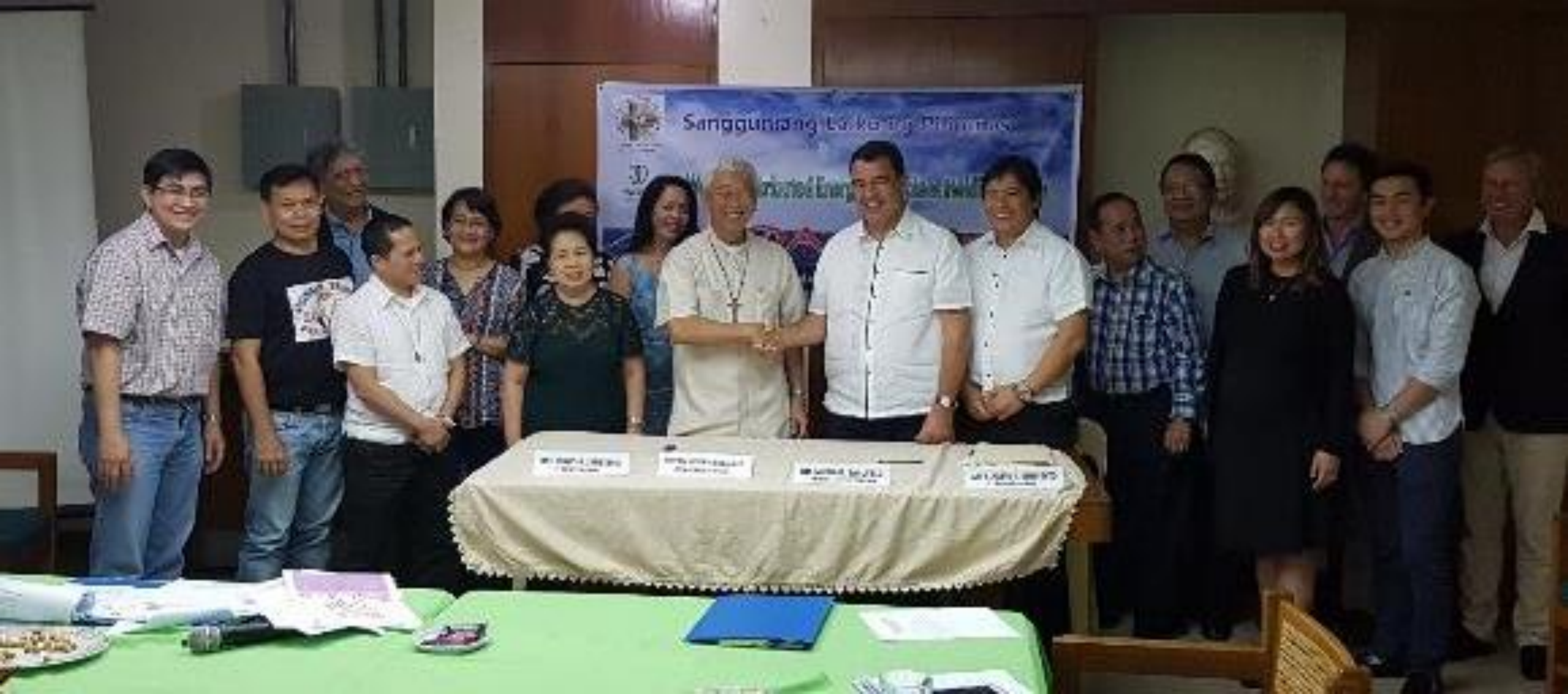
The Episcopal Commission on the Laity of the Philippine Episcopal Conference has signed a memorandum with WeGen Laudato si 'to encourage the use and access of renewable energy, especially solar energy, to the institutions of the Catholic Church and the poorest communities in the Philippines