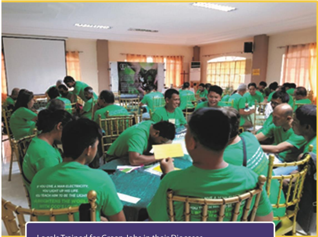
Locals Trained for Green Jobs in their Dioceses.