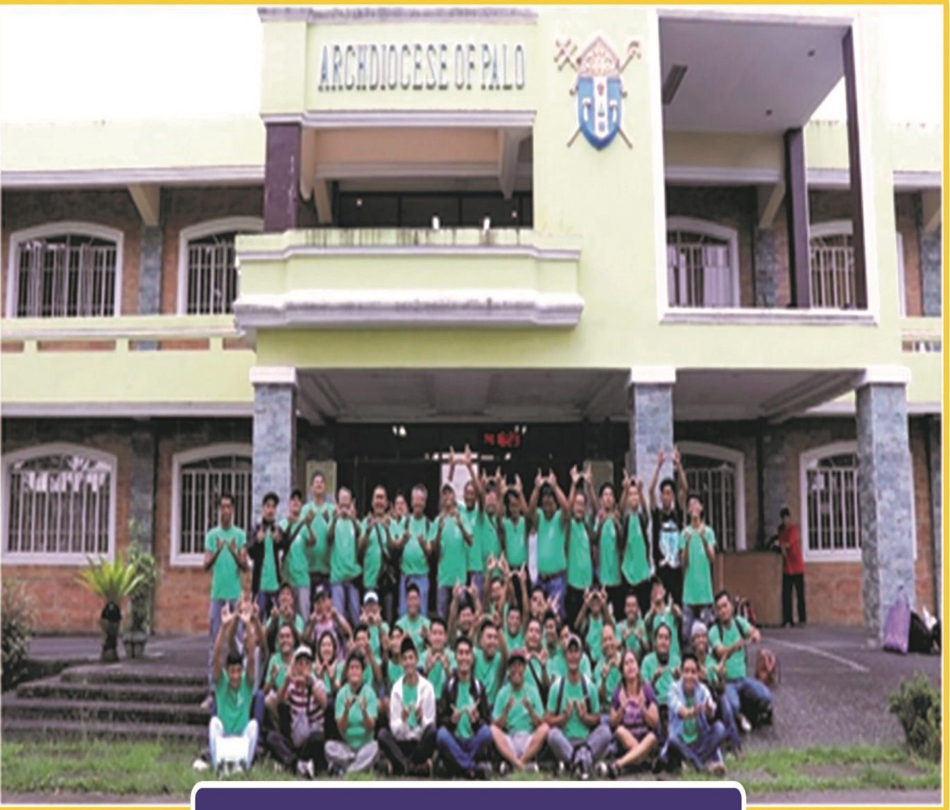
LTP graduates from the Archdiocese of Palo.